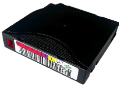
Spectra Certified Media LTO-10

Spectra Logic has meticulously designed a seven-step process that all media must pass before it qualifies as Spectra Certified Media. The rigorous certification process has been refined over multiple tape generations, millions of cartridges and several patents, ensuring superior media quality for efficient, pain-free backup and archive.