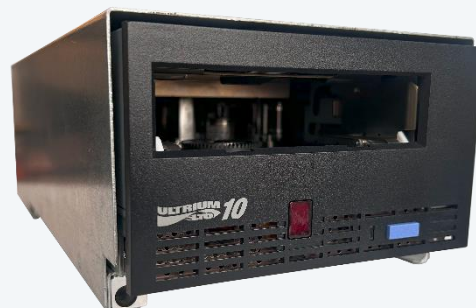
LTO-10 Tape Drive