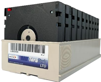
Spectra TeraPack Magazine

Spectra Certified Media provides worry-free data protection with the highest quality LTO and cleaning media.